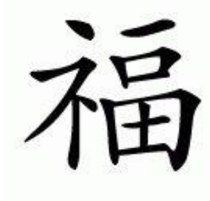
This is the brush stroke character